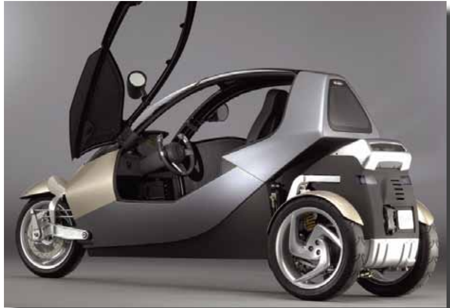
Clever Concept - developed by Bath University with the help of BMW